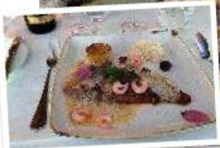
Exploring the myriad islands of Bohuslän, West Sweden, by sea kayak. Inset left, flounder fillet in brown butter with shrimp and horseradish at the Michelin-starred Sjömagasinet restaurant in Gothenburg