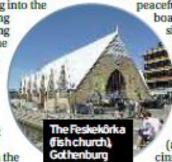
The Feskekörka (fish church) Gothenburg

Back on the seafood theme, the Michelin-starred Sjömagasinet, a short ferry ride down the river, provided an unforgettable waterfront meal - as unforgettable as the rest of this beautiful part of the world.