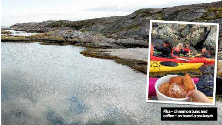
Fika - cinnamon buns and coffee - on board a sea kayak