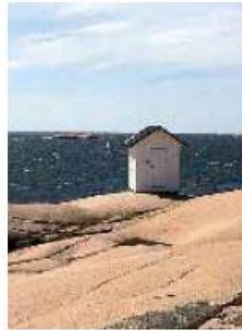
Pink granite rocks overlook the sea in Lysekil, above, and Haga Nygata street, Gothenburg, below, a hipster hotspot